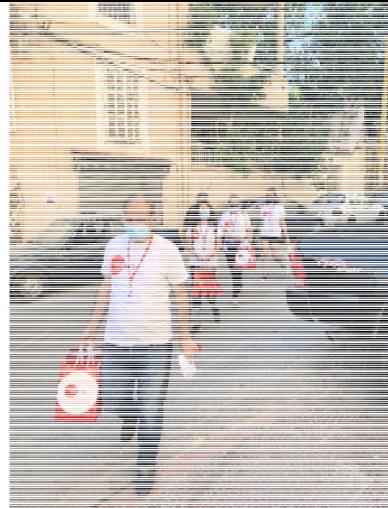
SDG 3 (Good Health and Wellbeing)