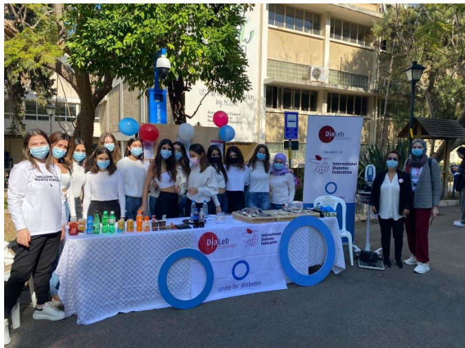
SDG 17 (Partnerships for the Goals)